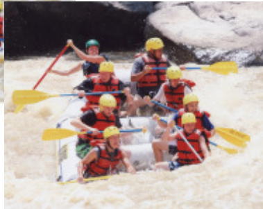
Highland Huddle's summer rafting trip

Thank you for your faithful support of this ministry. Picking blackberries is full of scratches, bee stings, bad berries, and thorns, but the rewards are sure worth it. Thank you for sending us out into the bushes looking for kids.