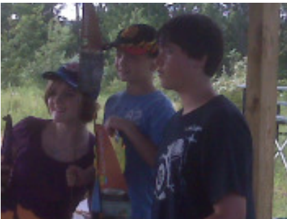
Winners of fishing derby at In the Whisper property

As the Director of Youth for Christ, I often feel that all of my correspondence with you needs to be positive and full of all the ways we are changing the world. I must apologize. I am not sure I feel that way now. We are seeing kids who seemed to be on the right track spiritually, suddenly change direction. I feel we are often fighting a battle that seems un-winnable. This economy has turned support raising into a decision between financially participating in God's work or paying the bills for many people. The news reports show that as a movement we, as Christians, hardly affect our neighbors and friends at all. Well, despite my lack of a positive outlook, God has been faithful , and we are seeing great things happen in the lives of kids. I wake up nearly every morning feeling we need to do more to reach kids, and often I feel way behind of that boat.