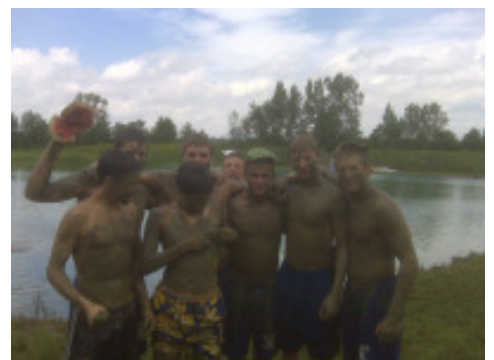
Champions of a greased pig contest at the In the Whisper property

As we picked blackberries, we found other things are actively looking forward to eating them, too. There are so many other forces trying to get our kids to follow them